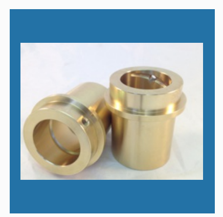
Aluminum Bronze Parts