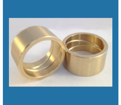
Phosphor Bronze Bushes