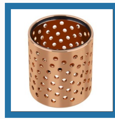
Brass Hot Rolled Sheet