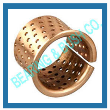
Homogeneous Bronze (Cu 91,3%, Sn 8,5%, P 0,2%)