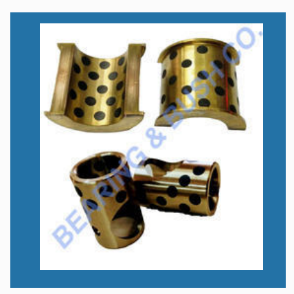
High Tensile Manganese Bronze Bushes