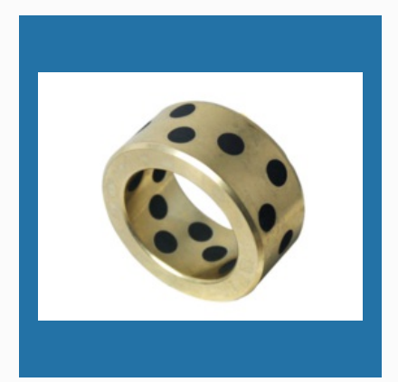
Graphite Bronze Bushes