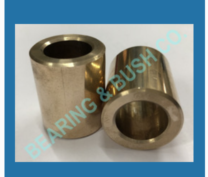
Gunmetal Bronze Bushes