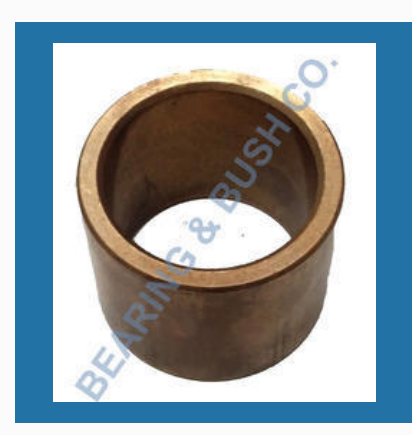
Sintered Bronze Bearing