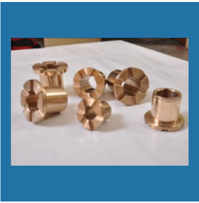
Casted Gunmetal Bushes