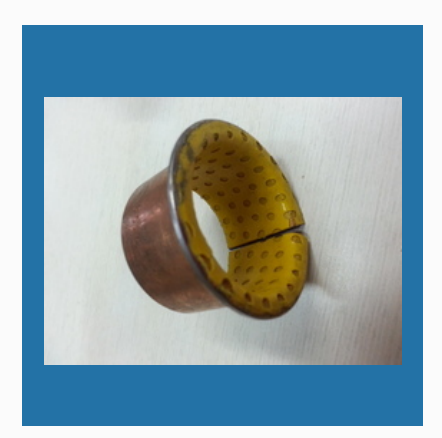
DX Type FDX Bushes