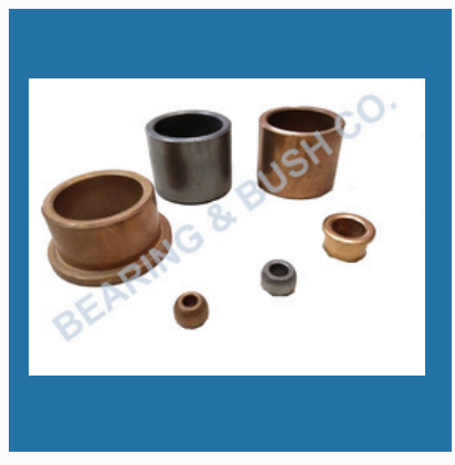
Sintered Bushes & Parts