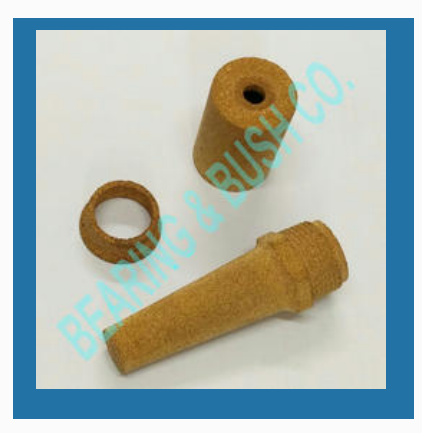
Sintered Bronze Filter